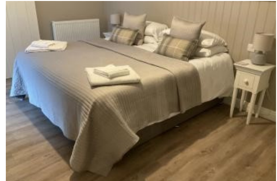
'Zip and link' king size bed.