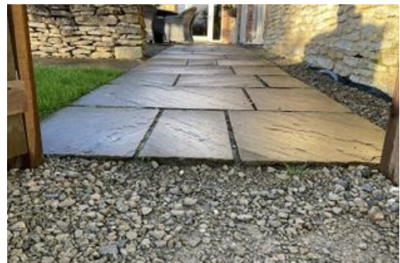
Gravel car parking surface leading to stone flagged pathway to the cottage.