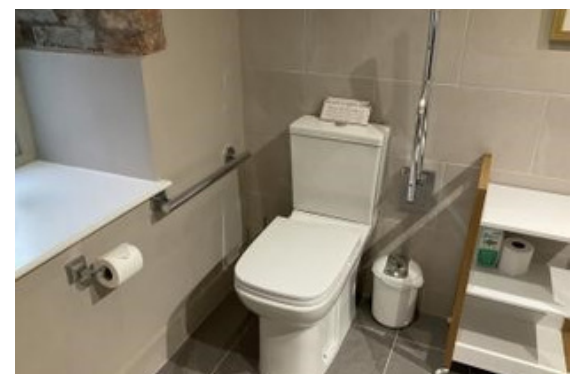
Right hand transfer toilet with grab rails and portable shelved trolley.