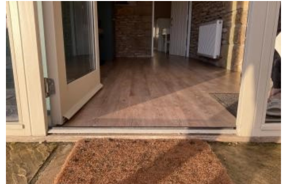
Main entrance door showing 70mm lip to the entrance.