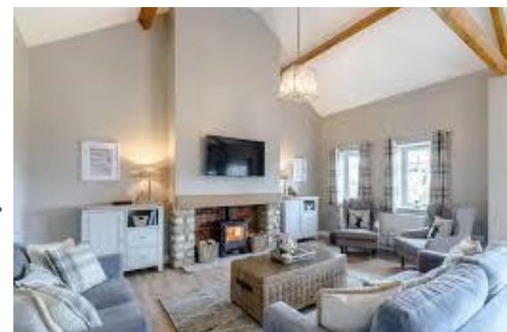
Open plan lounge area.