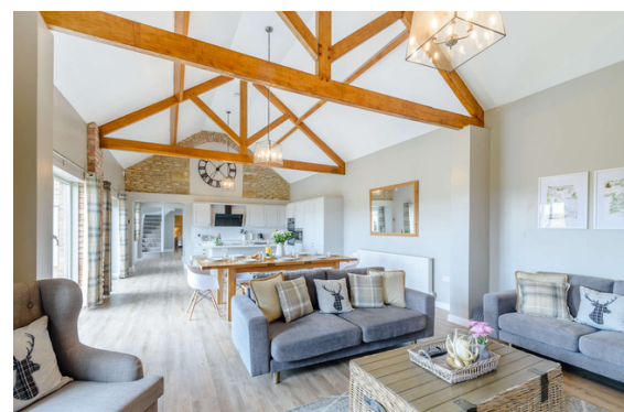
Open plan lounge area.