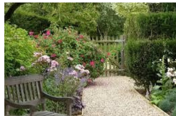
Gated entrance to rose garden with gravel surface.