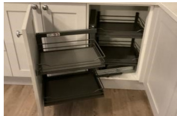
Easy access, low level cupboard storage.