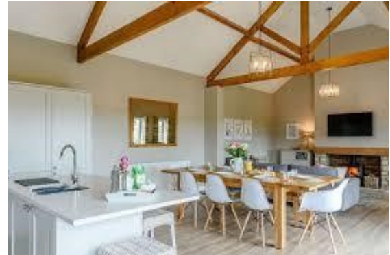
Open plan kitchen and dining area plus open plan lounge.