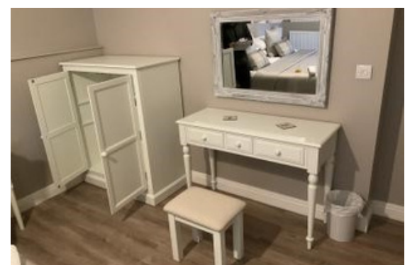
Wardrobe with lowered rail and dressing table.