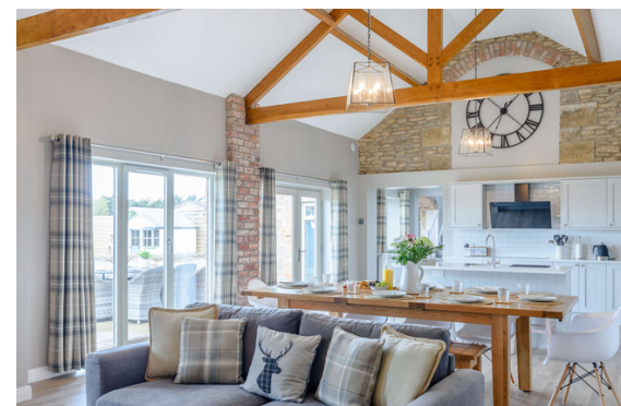
Open plan lounge area.