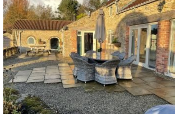
Stone flagged patio area with seating.