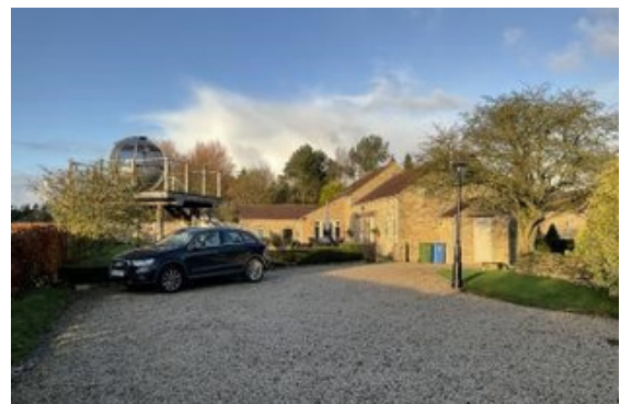
Car parking for four vehicles on gravel surface.