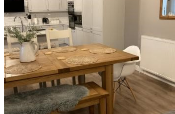
Open plan kitchen with central island and separate dining table.