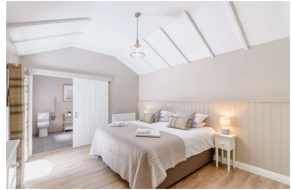
'Zip and link' king size bed.