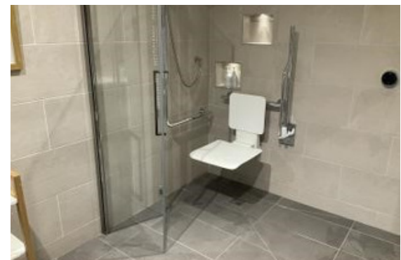
Spacious wet room with folding shower screen and shower chair.