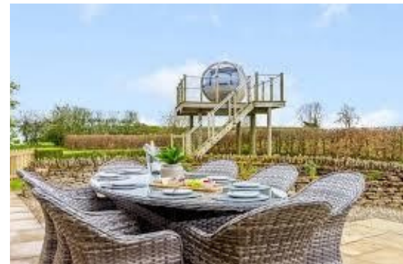
Elevated viewing pod in the garden.